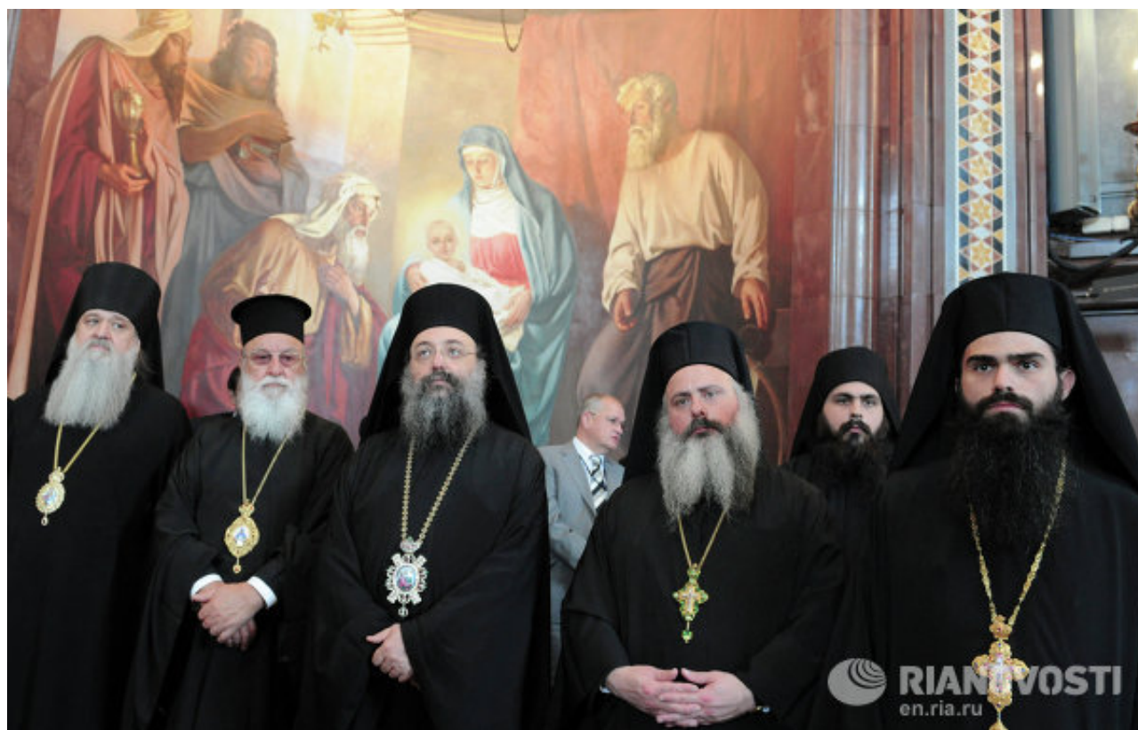
Greek clerics during a prayer at the arrival ceremony for the Cross of St. Andrew the Apostle at the Cathedral of Christ the Savior in Moscow, brought from the Greek Orthodox basilica in the city of Patra