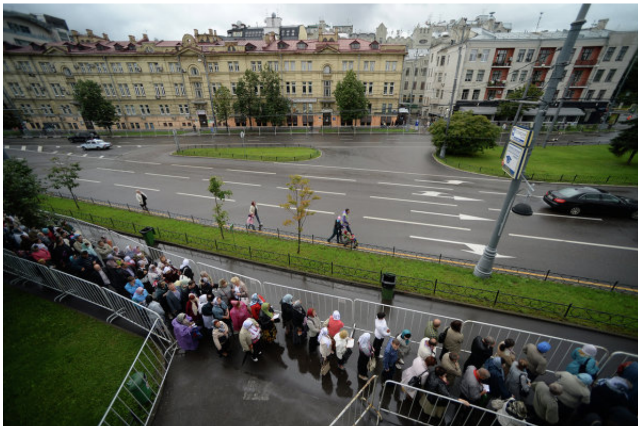
A line of Orthodox Christians waiting to see the Cross of St Andrew the Apostle