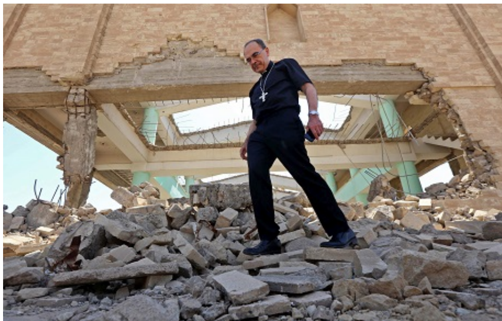
Lyon's Archbishop Cardinal Philippe Barbarin walks amid the rubble of the Martyr's church as he visits east Mosul on July 25, 2017. Barbarin hailed the "rebirth" of Iraq's devastated main Christian town of Qaraqosh a day earlier, where residents are returning following two years of jihadist rule.