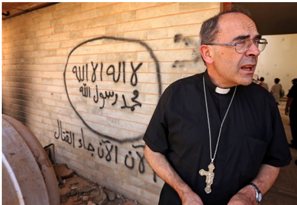
Lyon's Archbishop Cardinal Philippe Barbarin stands next to ISIS graffiti reading "There is no other god, but Allah and Mohammed is the Messenger of Allah" during a visit to the Church of the Annunciation in east Mosul.