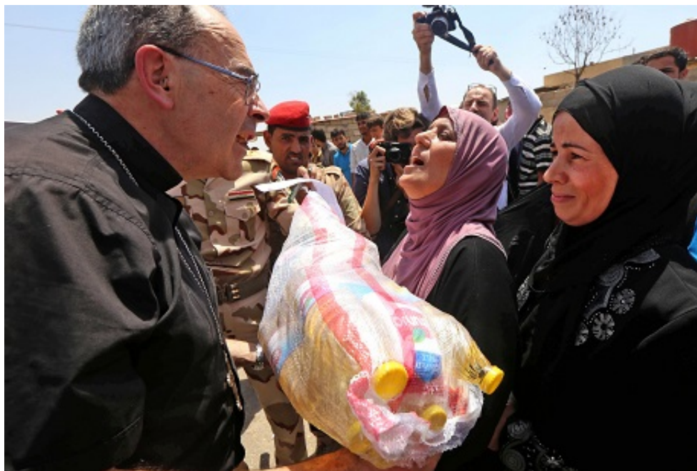
The Archbishop Cardinal distributes food aid to an Iraqi woman. He hailed the “rebirth” of Iraq’s devastated mainly-Christian town of Qaraqosh.